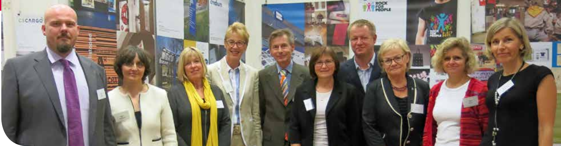
Minister of Health, Norwegian Ambassador and Project Partners at Final Project Conference in Prague