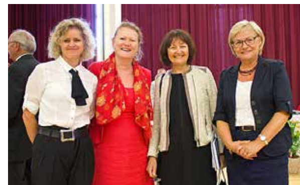
Norwegian Ambassador and Norwegian Project Partners at Final Project Conference in Százhalombatta